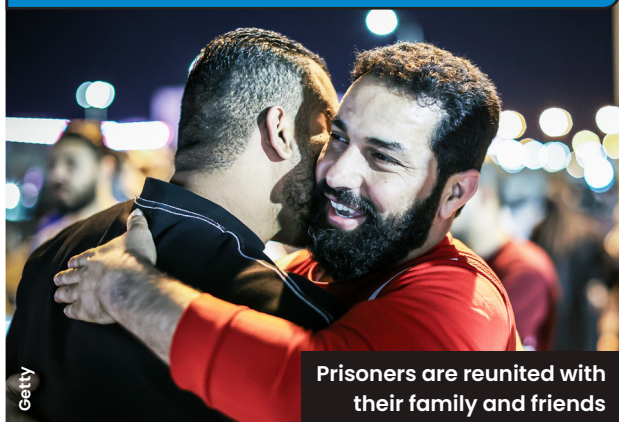
Prisoners are reunited with their family and friends