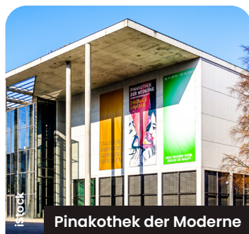
Pinakothek der Moderne

A man in Germany has been fired from the art gallery he worked at, after owners discovered he'd hung his own artwork in an exhibition. The 51-year-old budding artist decided to drill two holes in a wall at Munich's Pinakothek der Moderne and hang up his painting for all to see. Supervisors quickly spotted the unusual piece and took it down. The man has been banned from the gallery now.