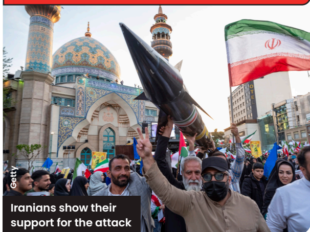
Iranians show their support for the attack