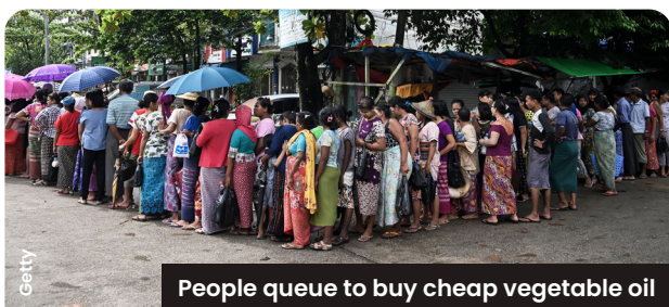
People queue to buy cheap vegetable oil

The amount of people in Myanmar who are living in poverty is rising, with the middle class "disappearing", says a new report by the UN Development Programme. Three-quarters of the country's population is either living in poverty or "perilously close" to the national poverty line. The report polled more than 12,000 households and many said they're struggling to get basic healthcare. Families are also having to pull their children out of school because they can't afford it. Conflict has caused many problems in the country – a rebellion in 2021 saw power seized from the government and handed to the military.