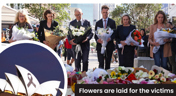
Flowers are laid for the victims