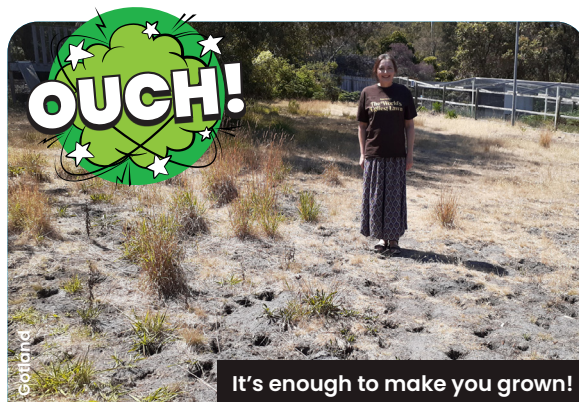
It's enough to make you grown!

People from around the world posted their pictures in to the contest, organised in Gotland, Sweden. The project aims to raise awareness of "saving water on a global scale by changing the norm for green lawns".