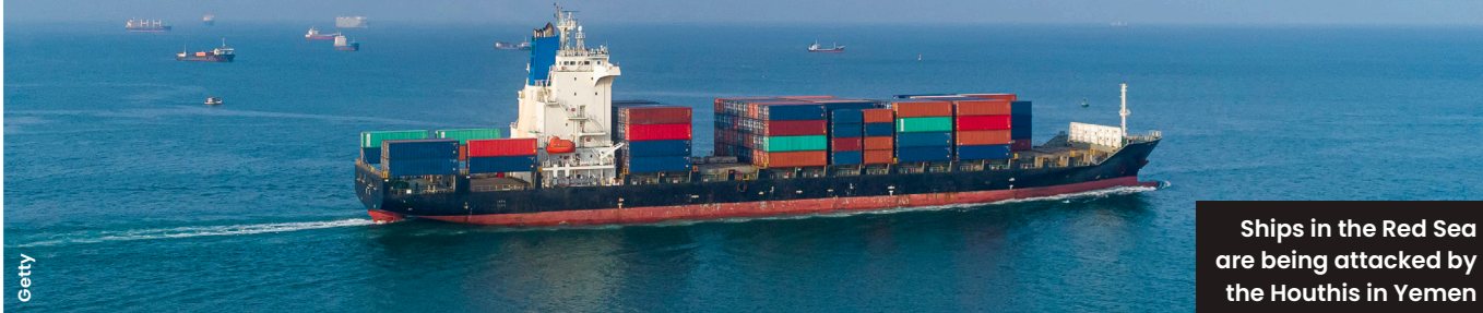
Ships in the Red Sea are being attacked by the Houthis in Yemen

THE Prime Minister, Rishi Sunak, says Britain is ready to protect itself after striking back against a group that is attacking ships in the Red Sea.