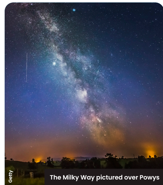
The Milky Way pictured over Powys

A SMALL town and neighbouring village in rural Wales has welcomed the stars – and the odd comet, too!