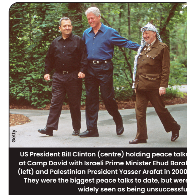
US President Bill Clinton (centre) holding peace talks at Camp David with Israeli Prime Minister Ehud Barak (left) and Palestinian President Yasser Arafat in 2000. They were the biggest peace talks to date, but were widely seen as being unsuccessful

Other issues that the two sides don't agree on are the right of around five million Palestinian refugees in other Arab countries to return to Palestine, and whether a Palestinian state should be allowed to have an army.