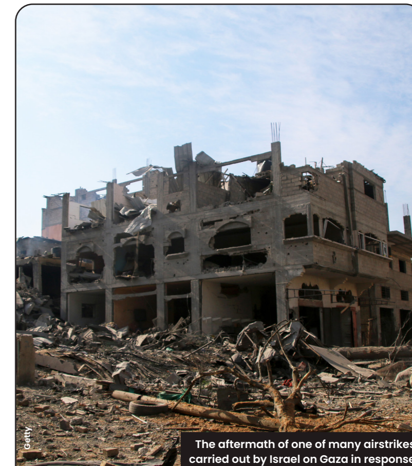
The aftermath of one of many airstrikes carried out by Israel on Gaza in response

The West Bank is run partly by the Palestinian Authority and partly by Israel now. A Palestinian group called Hamas runs Gaza, but it has been declared a terrorist organisation by many countries, including the UK, US and the EU. Hamas is supported by Israel's rival Iran, which supplies it with money, weapons and military training.