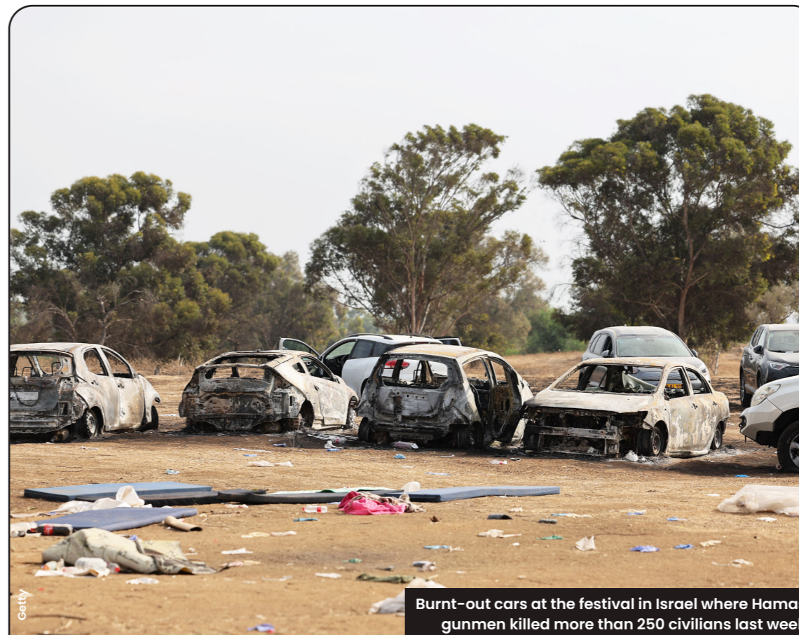
Burnt-out cars at the festival in Israel where Hamas gunmen killed more than 250 civilians last week

Israel declares independence. Soon after, a war begins and Israel seizes Palestinian land. The UN says that Palestinians forced from their land should be allowed to return.