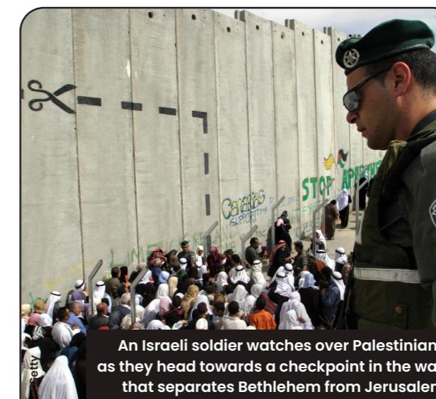
An Israeli soldier watches over Palestinians as they head towards a checkpoint in the wall that separates Bethlehem from Jerusalem

Even in Israel, not everyone agrees with how the country treats Palestinians. The Israeli human rights organisation B'Tselem says that Israel controls the region with "one